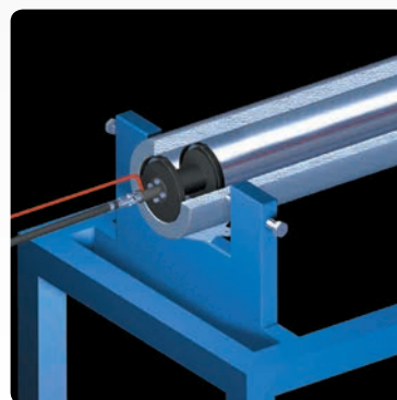
Detector with adapters in the tube.