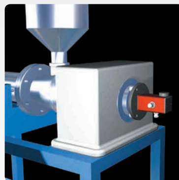
Laser transmitter on the gearbox spindle.