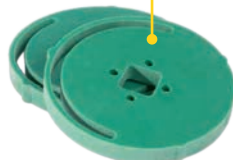
Tube adapters for detector (manufactured to order to fit the actual diameter).

Laser transmitter D75 has a measurement distance of 40 m [130']. Powered by one 1.5 V R14 (C) battery.